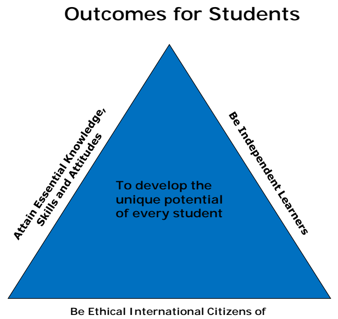
a Changing and Challenging World